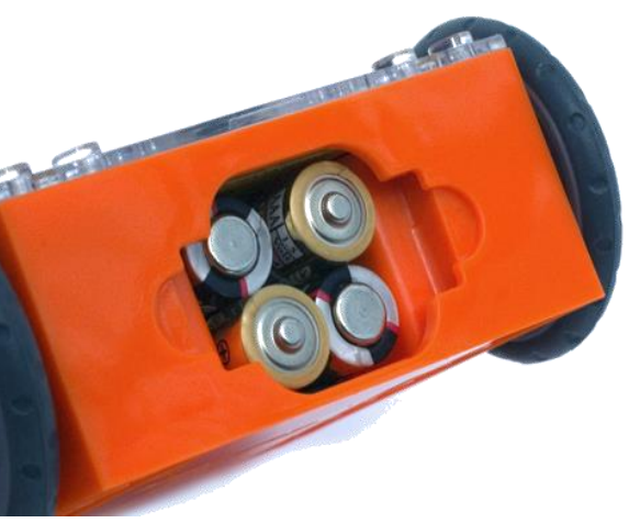
Ensure the batteries are in the right way.

Choosing batteries: If using disposable batteries with Edison, only ever use alkaline batteries.