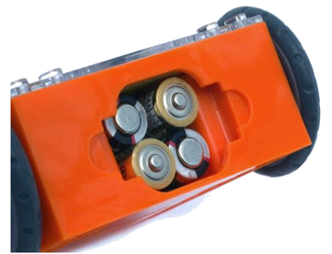
Ensure the batteries are in the right way.

Please note: Low or flat batteries can cause a range of issues with Edison. For this reason, always use fresh, fully charged batteries in your robots.